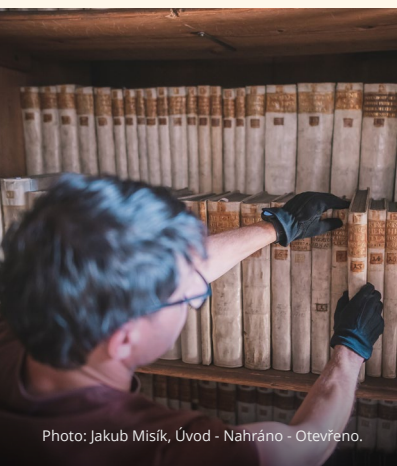
Úvod - Nahráno - Otevřeno.