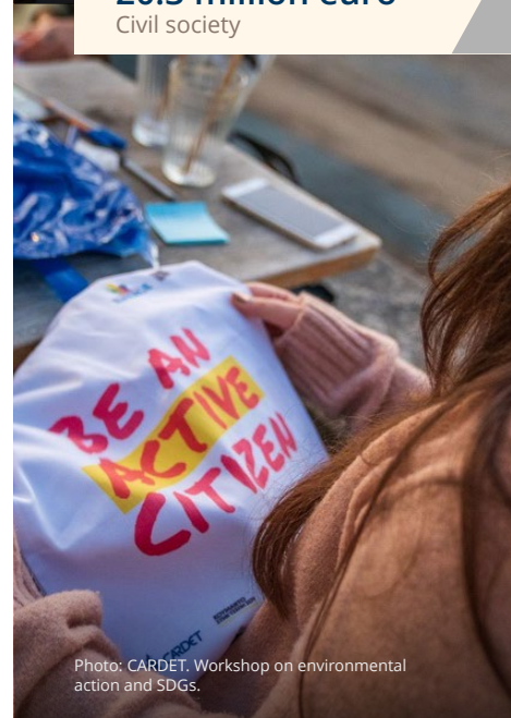
Workshop on environmental action and SDGs.